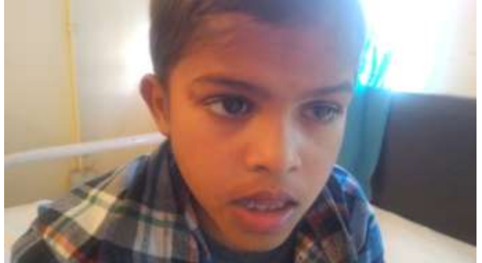
Fig. 1 showing watering of eyes